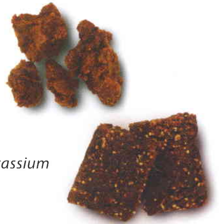
Fig Slurry, Soft 40 Fig Paste